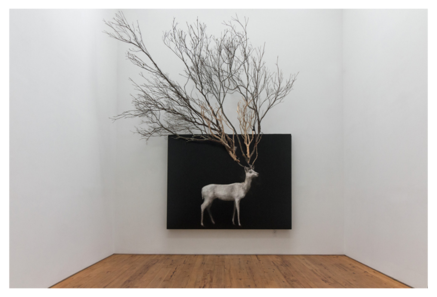
Stag, 2016, Mixed media (Oil on plexiglas with archival digital print and branches), 74 x 96 inches Branches variable dimensions

TAGS: BROOKLYN ARTIST (HTTPS://ARTEFUSE.COM/TAG/BROOKLYN-ARTIST/), CONTEMPORARY ART (HTTPS://ARTEFUSE.COM/TAG/CONTEMPORARY-ART/), MARC STRAUS (HTTPS://ARTEFUSE.COM/TAG/MARC-STRAUS/), PAITNING (HTTPS://ARTEFUSE.COM/TAG/PAITNING/), SCULPTURE (HTTPS://ARTEFUSE.COM/TAG/SCULPTURE/), STAG (HTTPS://ARTEFUSE.COM/TAG/STAG/), TODD MURPHY (HTTPS://ARTEFUSE.COM/TAG/TODD-MURPHY/), WILD LIFE ART (HTTPS://ARTEFUSE.COM/TAG/WILD-LIFE-ART/)