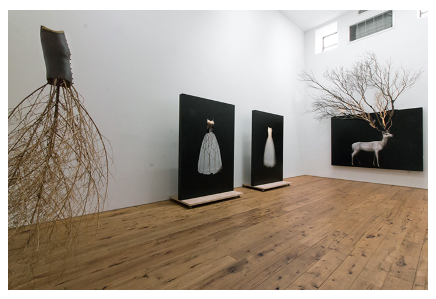
Installation view of Todd Murphy at Marc Straus, New York, 2016

The mood changes in the second room with works like Candle Man , which presents a gleaming orange candle set against a black background. Executed in incredible detail, you can almost sense the flame's crackle and swaying glow. Before electricity, the candle was used for reading and writing. It is not hard to imagine a Naturalist using this candle to work after returning from a day in the field. This connection is furthered with the realization that the candle seems to radiate from within a human figure. A nearby work shows a deer alone in a forest during winter. The animal stands far back in the picture plane and is surrounded by tall trees. Using only variations of black and white, Murphy has created a compelling impression that expresses the sanctity of natural world.