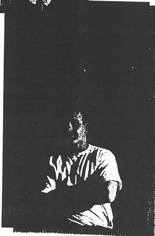
Murphy's latest work, "Jonah" (top). The artist in 1994 (right). His earlier rendition of a horse (above), "The King Plow," 1992.